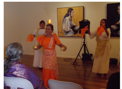
Above: Our fabulous Taree Filipino dancers performed the Candle Dance.