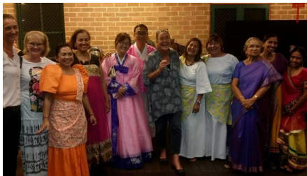
Above: What a great time!